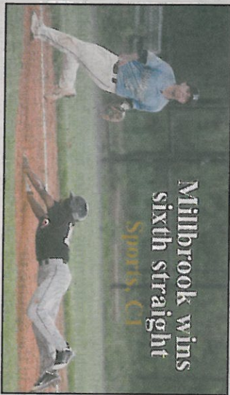
Millbrook wins sixth straight